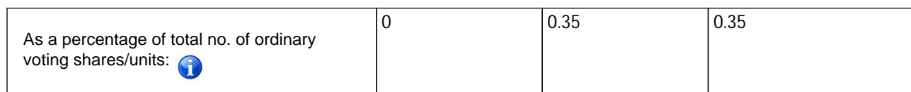
Table 3. Change in respect of rights/options/warrants over shares/units of Listed Issuer